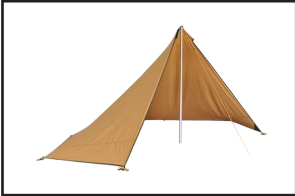
Canopy 5/7 put up as a wind-break

Putting up the canopy as a wind-break or freestanding shelter