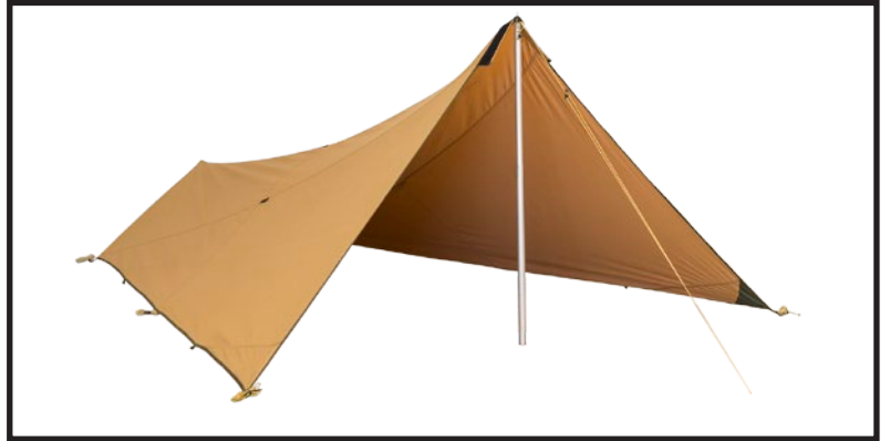
Canopy 7/9 put up as a wind-break