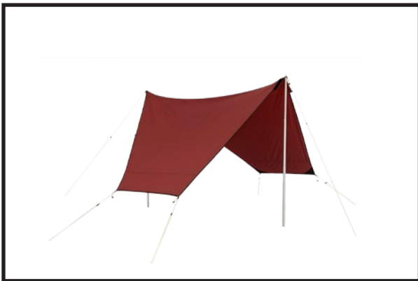
Canopy 5/7, lightweight model, put up as a freestanding shelter

First of all, put a tent peg in the band loop on the side opposite the side with the Velcro fastening. Push the end of a telescope pole through the eyelet by the Velcro fastening and adjust it to a suitable height. Peg the cord down and tighten it. Place tent pegs along the long sides. Canopy 5/7 has band loops for two tent pegs on each side while Canopy 7/9 has band loops for three tent pegs on each side.