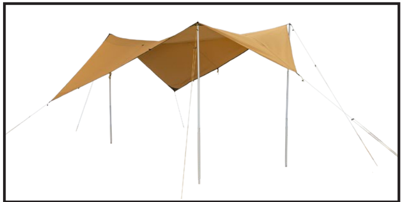
Canopy 7/9 put up as a freestanding shelter