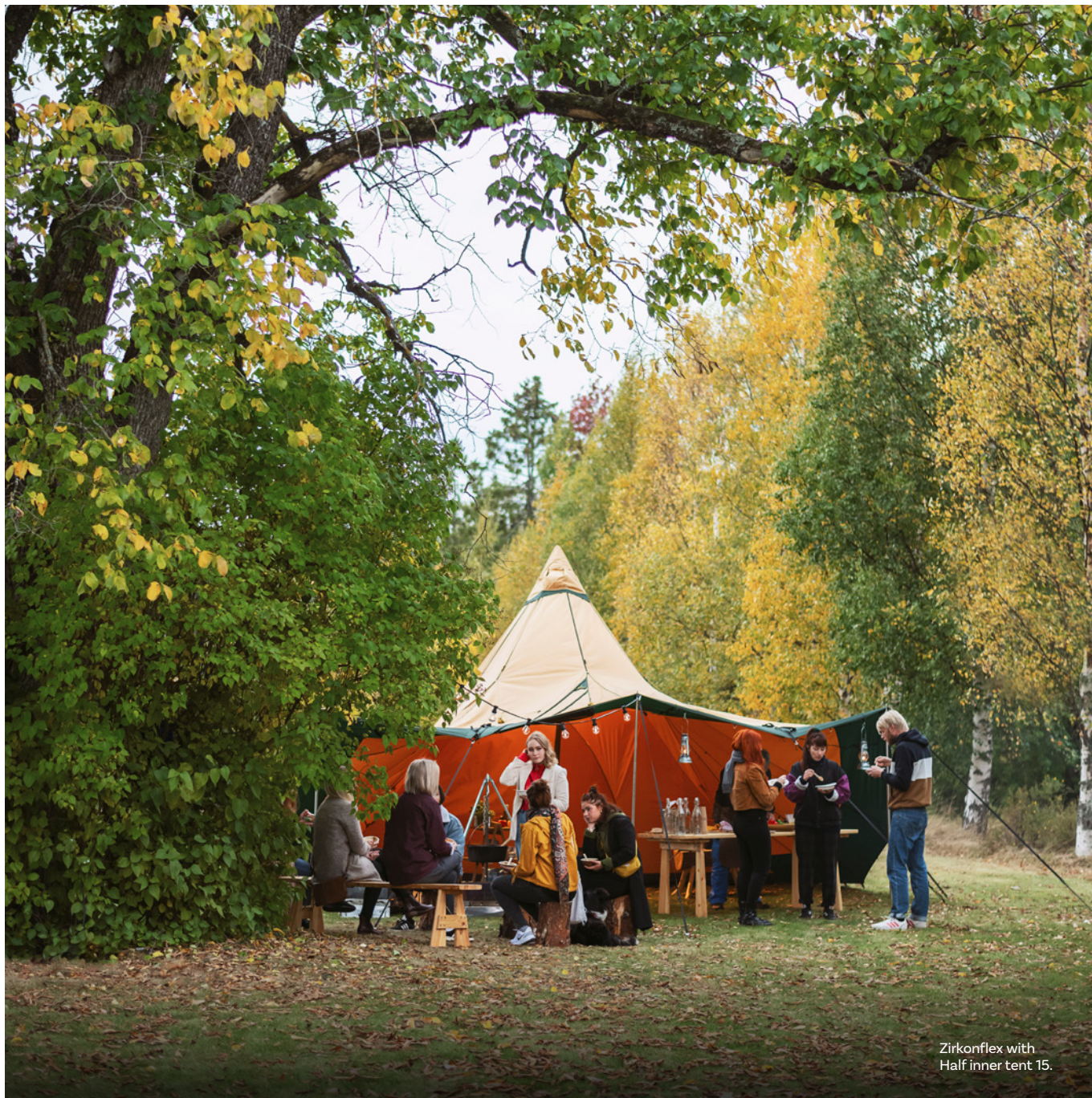
Zirkonflex with Half inner tent 15.