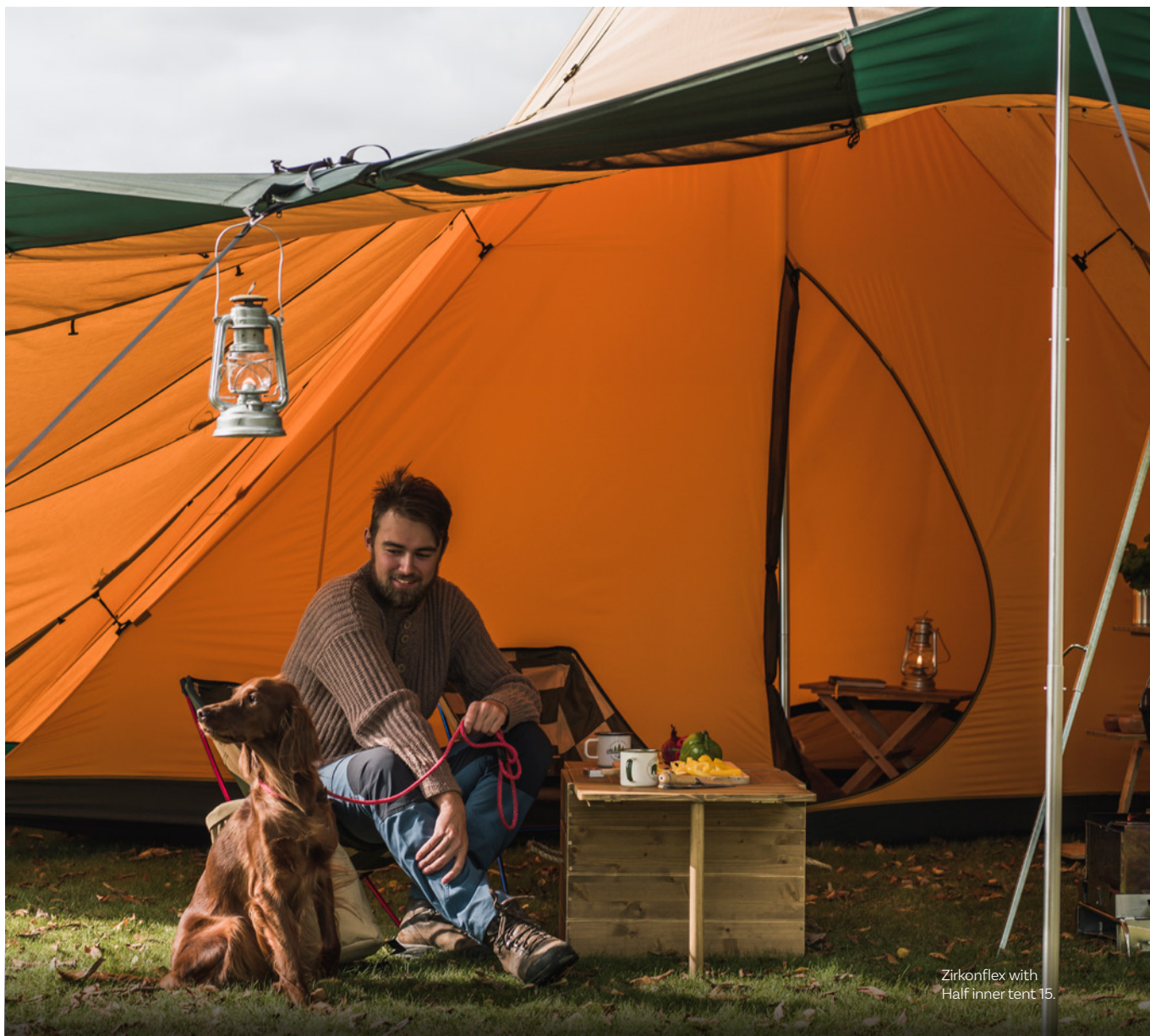
Zirkonflex with Half inner tent 15.