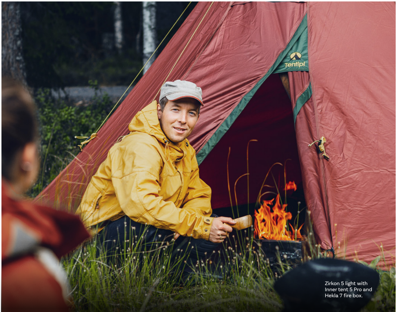
Zirkon 5 light with Inner tent 5 Pro and Hekla 7 fire box.