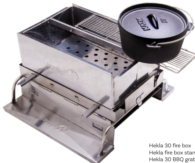
Hekla 30 fire box Hekla fire box stand Hekla 30 BBQ grate

The fire box is indispensable if you are going to build a fire on snow. The legs fold out and can be placed on branches or other support material on the snow, thereby preventing the fire box from sinking into the snow. Hekla fire box stand is another alternative that prevents the firebox from sinking because of the heat.