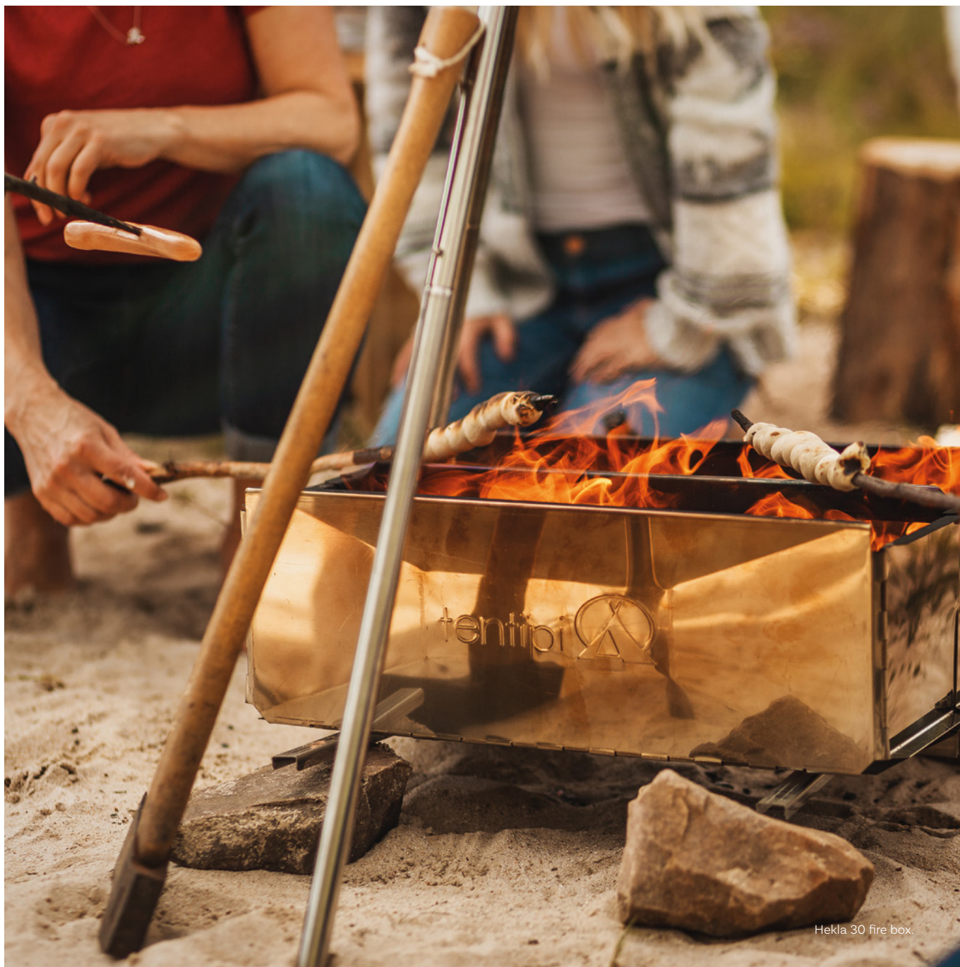
Hekla 30 fire box.