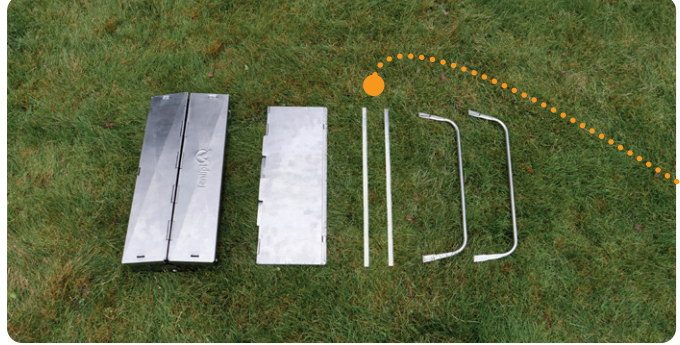
*Two extra rods are included with the Hekla fire box stand. Use these with Hekla 7 instead of the original, shorter rods. The original rods of Hekla 30 will fit when using this fire box with the stand.