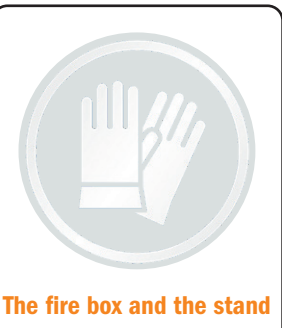
may have sharp edges so always use gloves when assembling them!