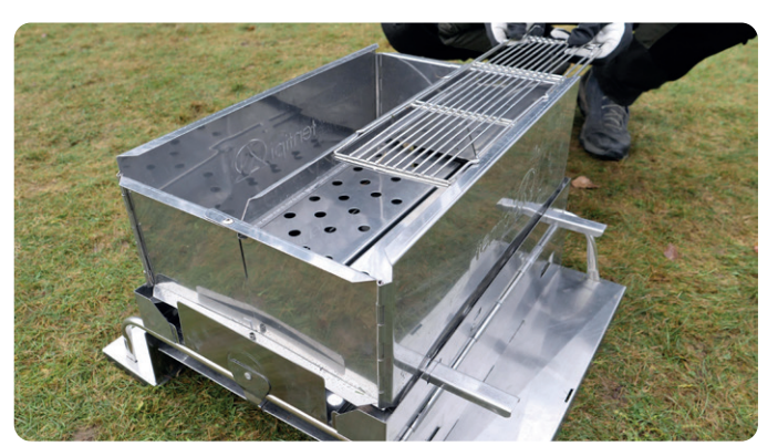
*Hekla BBQ grate 30 is available as an accessory for Hekla 30.