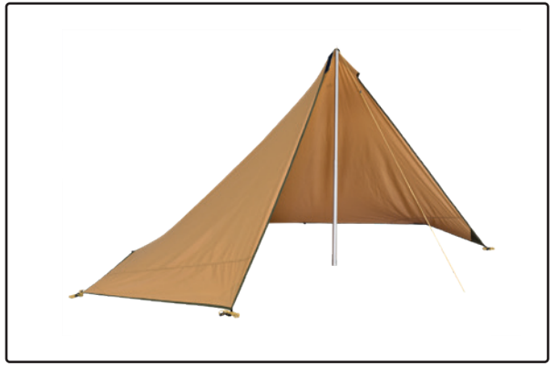
Canopy 5/7 put up as a shelter

First of all, put a tent peg in the band loop on the side opposite the side with the Velcro fastening. Push the end of a telescopic pole through the eyelet by the Velcro fastening and adjust it to a suitable height. Peg the cord down and tighten it. Place tent pegs along the long sides. Canopy 5/7 has band loops for two tent pegs on each side while Canopy 7/9 has band loops for three tent pegs on each side.