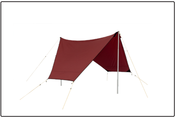
Canopy 5/7, lightweight model, put up as a freestanding canopy

There are two cords on each long side of Canopy 7/9 as well which can be used if more stability is required.