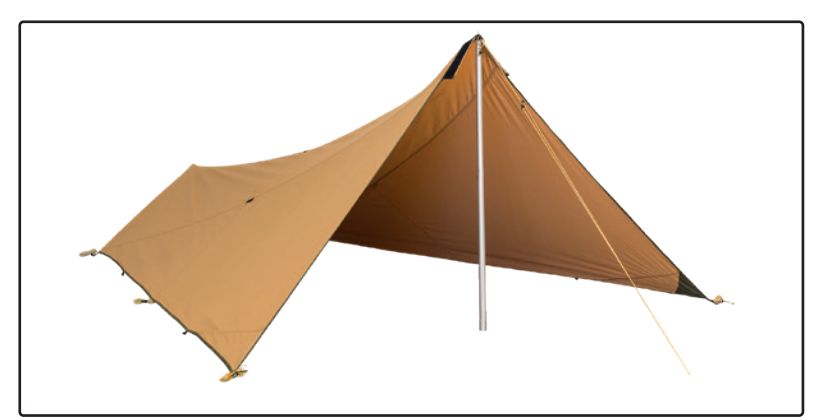
Canopy 7/9 put up as a shelter