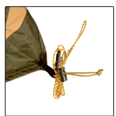
3. Peg the other cords to the ground. Adjust and tighten so the canopy fits snugly against the tent.