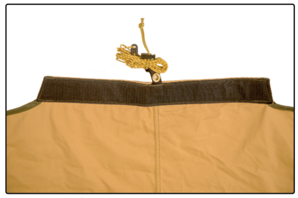
The canopy's fastening is connected to the Nordic tipi's accessory sleeve. The eyelet and cord are used when the canopy is put up as a freestanding shelter, see the pictures on the opposite page.