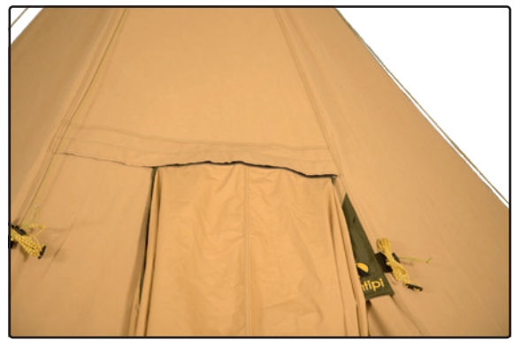
1. Attach the canopy to the accessory sleeve. Press firmly all along the Velcro strips. The canopy is mounted on the right so that rain water is led away from the tent opening.