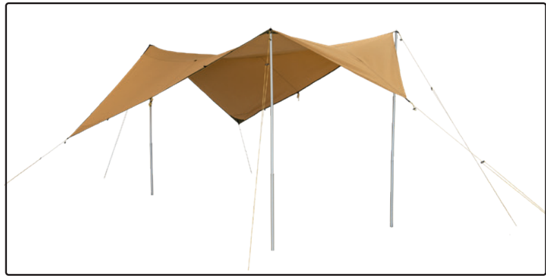
Canopy 7/9 put up as a freestanding canopy