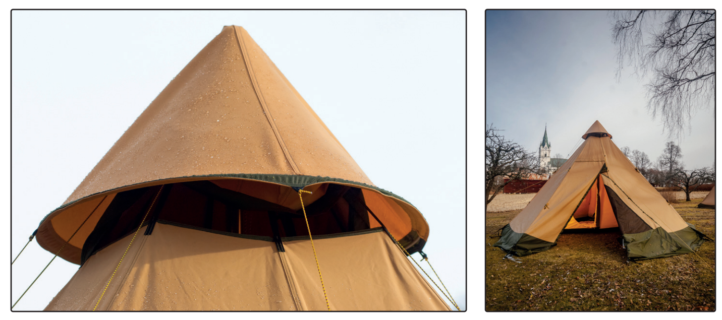
When the rain hat is mounted, it is possible to maintain a pleasant indoor climate on warm, rainy days since the ventilator cap can be fully open without rain coming in.

The four adjustable cords are attached with toggles to four of the buttonhole bands, where the storm cords and the ventilator cap are attached, see picture 6. Keep the rain hat's cords loose so as to facilitate the pitching of the Nordic tipi. Once the tent is erected, the cords can be adjusted using the buckle, see picture 7.